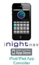
iNightNav Available on the AppStore iPod/iPad App Controller