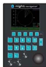
Panel-Mount Hardware Controller