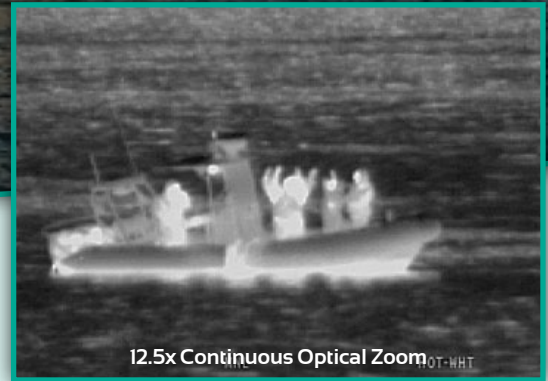
12.5x Continuous Optical Zoom OT-HHT